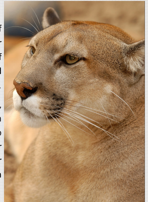
Florida panther by RJ Wiley

Governor Scott's proposed FY14 budget included $75 million for Florida Forever – 1/3 from new appropriations and 2/3 from sale of existing state lands not needed for conservation and recreation. Florida's population is once again growing at a rapid pace. Investing now in conservation land and water resources helps preserve some of Florida for our citizens of today and tomorrow.